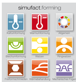
Bild 2: Eine der Neuerungen in Simufact.forming 12: Application Function Sets (AFS) vereinfachen die Bedienung der Simulationssoftware

Picture 1: Simulating screw manufacturing with Simufact.forming 12